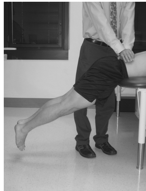
Figure 1. Prone instability test: In this test, the patient is prone, with legs off the table and feet on the floor. The clinician applies posterior-anterior pressure over the lumbar spine and assesses for pain. The patient then engages extensors and lifts feet off the floor. The test is positive if pain is elicited with pressure and relieved with active extension, as this is thought to indicate temporary pain relief through stabilization of the spine (22).

Research on core stability exercises has been hampered by a lack of consensus on how to measure core strength. If core instability and core weakness can be measured, outcomes can be followed and a proper emphasis can be placed upon core strengthening in certain individuals. Delitto and others